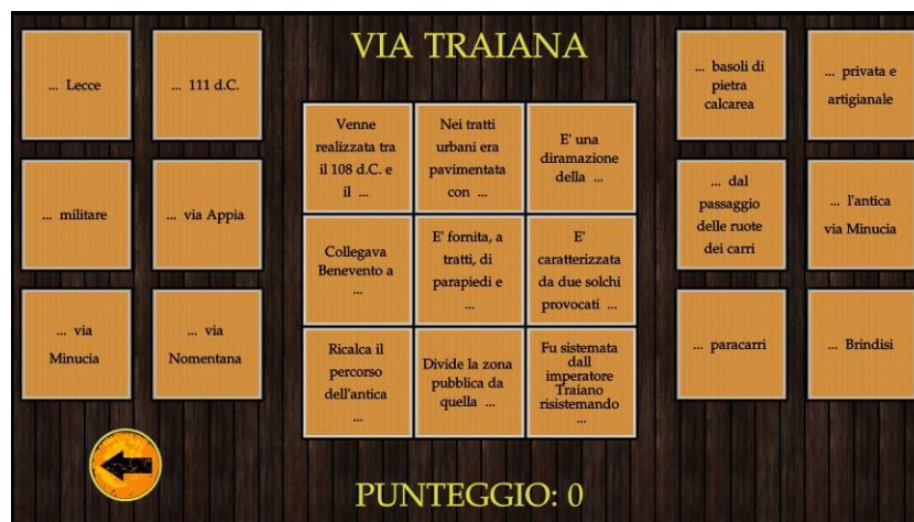
Figure 2. The screen to start solving the puzzle “Via Traiana”

History-Puzzle is designed to be played by children interacting with a multi-touch display installed in a school laboratory, in an indoor space of an archaeological park, or in a museum. It is named History-Puzzle because groups of pupils collaborate to reassemble puzzles to discover elements of interest at an historical site. In the game played after a visit to the archaeological park of Egnathia, in Southern Italy, the puzzle images are significant places in this ancient Roman city, e.g. the Civil Basilica (the Law Court), the Trajan Way (the main road from Rome traversing Egnathia), the Foro Boario (the animal market square), the Kiln (oven for cooking terracotta vases). For example, after a player selects a puzzle, such as the Trajan Way (Via Traiana in Italian), a screen like the one shown in Figure 2 appears. The figure to be discovered by solving the puzzle is at the center of the screen. The nine square tiles covering the figure contain incomplete sentences reporting historical notions about the selected place. For each tile, the players choose the rest of the sentence from the tiles displayed on the left and right sides of the puzzle and drag it onto the tile in the figure.