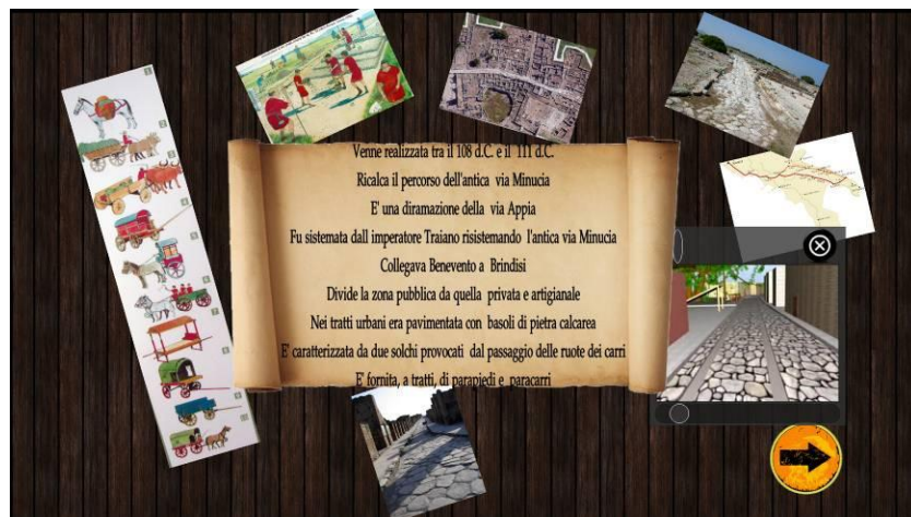
Figure 4. Multimedia contents associated to the “Via Traiana” puzzle

Some tricks are inserted to make the game more challenging and intriguing: 1) more than nine tiles are shown outside the puzzle: these additional tiles report false answers or answers that do not match any of the nine incomplete sentences displayed; 2) the positions of the tiles with incomplete sentences and those with completing sentences are randomly reassigned each time the puzzle is run; 3) sentences are randomly chosen from a file containing about 30 sentences for each puzzle. When the nine sentences have been completed and the whole image is displayed, a new game screen is shown. It proposes different multimedia contents: a papyrus reporting all the puzzle sentences, a short video showing the 3D reconstruction of the place, photos of the place, the half-section plan of a building (Figure 4).