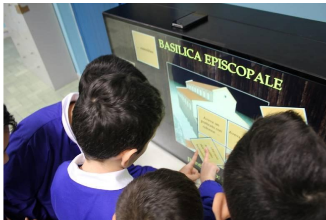
Figure 6. Two pupils moving a tile together

The groups mainly stayed united and collaborated to reassemble the puzzle. If one member tended to draw back the others encouraged her/him to take a more active part. This cohesion was particularly evident when they got into difficulties, as demonstrated by the following pupil's exclamation: "United we stand" (see Figure 6).