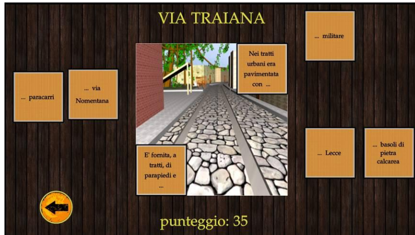
Figure 3. Seven parts of “Via Traiana” have been discovered

In the example in Figure 2, the sentence “Collegava Benevento a ...” (“It connected Benevento to...” in English) is associated to the town name “... Brindisi”. If the selected association is correct, the tile will reveal one ninth of the 3D reconstruction of the original place. Figure 3 shows what it looks like when the player has discovered 7/9 of the image.