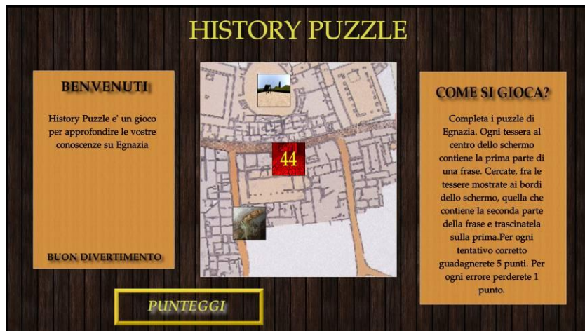
Figure 5. Map of the archaeological park showing the available puzzles

score mechanism stimulates children to reflect upon their actions and leads them to discuss together on the tiles they have to associate.